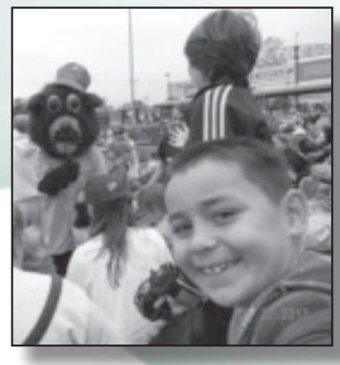
Children and families enjoy the excitement of baseball, and more.

"spin-art." Three waiting children were invited to throw out the first pitch.