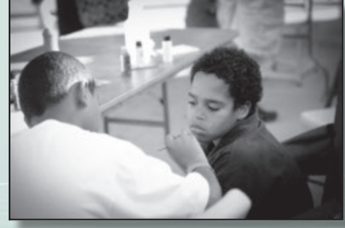
Children have their faces painted before the game.

The third annual Diakon Adoption & Foster Care/SWAN Older Child Matching Initiative Night at the Harrisburg Senators took place in August with the goal of spreading adoption and foster care awareness throughout the greater Harrisburg area, recruiting potential adoptive and foster families, and providing waiting families and youths with the opportunity to interact in a fun, low-stress atmosphere. This year, 18 SWAN-affiliated agencies, more than 50 waiting families, and 21 waiting youths from throughout Pennsylvania attended.